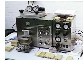
TT Vacuum Wax Injector