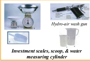
Hydro-air wash gun