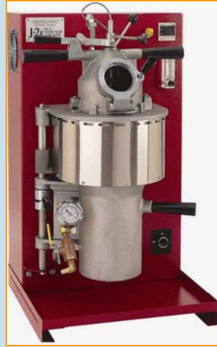
J2-r series IV Resistance Vacuum Casting machine