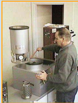
Vacuvest #5-25 & 7 cfm vacuum pump