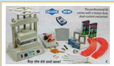
Rio Grande Mould making kit #701-213